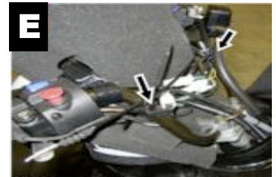
Cable shroud should follow as straight a line as possible from left to right, using zip ties to secure shroud to bars (see arrows for positioning)

11) Replace the handlebar padding and vinyl cover.