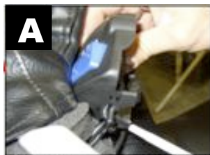
Trimming slightly where the pen is touching will allow switch housing to fit better, giving more room on handlebar for GOLDFINGER perch.