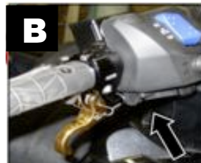
Position GOLDFINGER lever perch with the lever in the 6:00 position